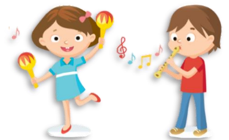
Music and Dance