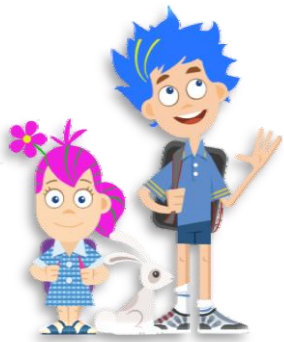
Crazy Hair Day