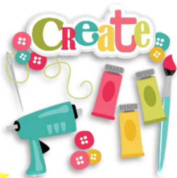
Art's & Crafts